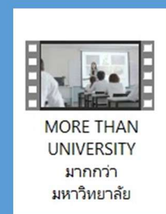
6. Final checking