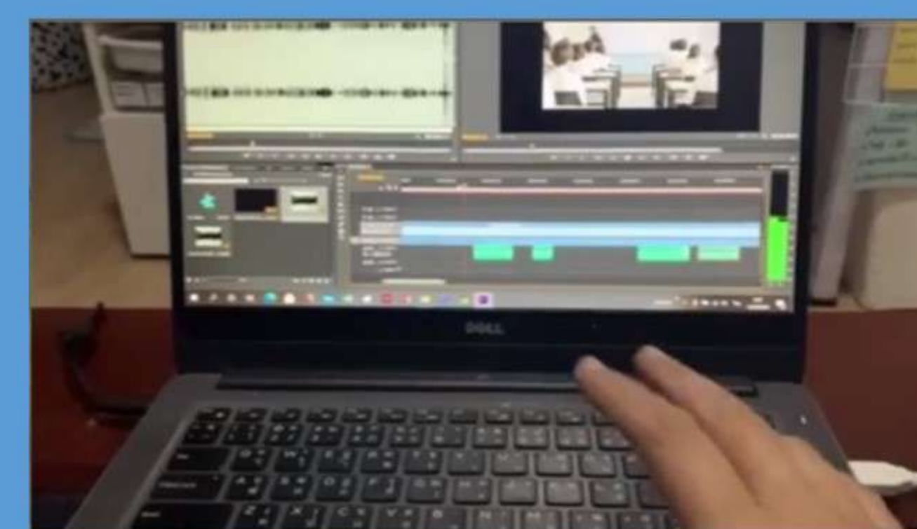
5. Customizing picture and sound