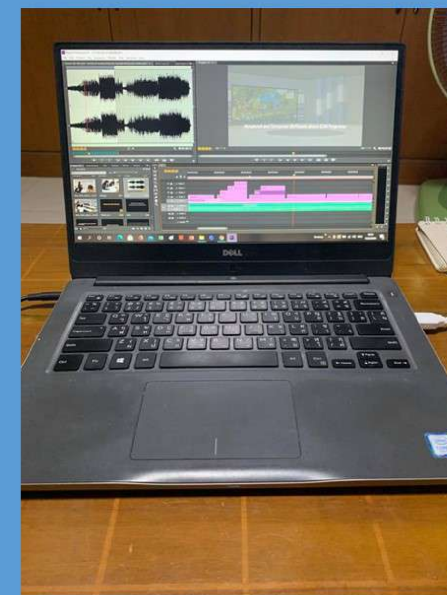
1. VDO Checking